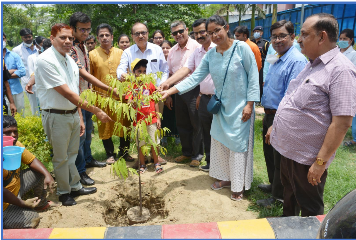
Plantation drive at Vrindavan Colony, Lucknow