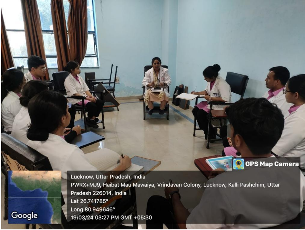
Mentor-mentee meeting 19/03/2024