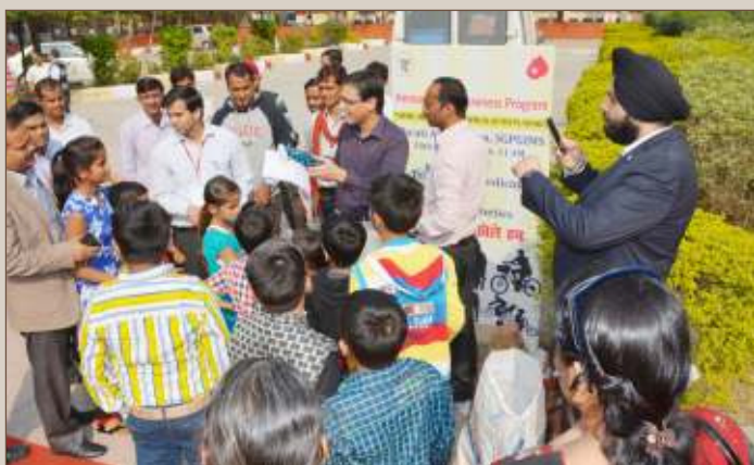
Hemophilia Awareness Program on the theme Hemophilia & physical activity /sports