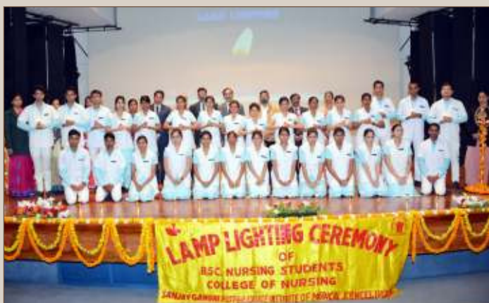
8 th Foundation Day & Lamp Lighting Ceremony of College of Nursing