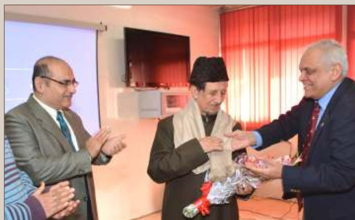
Hon'ble Maulana Kalbe Sadiq, was the Chief Guest on the Foundation Day of the Deptt. Of Neurology.