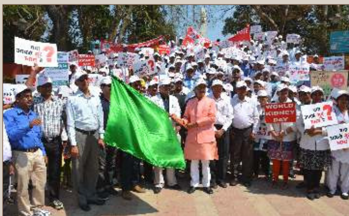
Nephrology Deptt organized a 'Walkathon' from Shahid Smarak to KD Singh Babu Stadium to mark the World Kidney Day