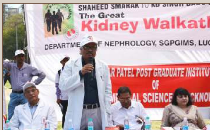
"Are Your Kidneys Okay?" special awareness program organised at KD Singh Babu Stadium