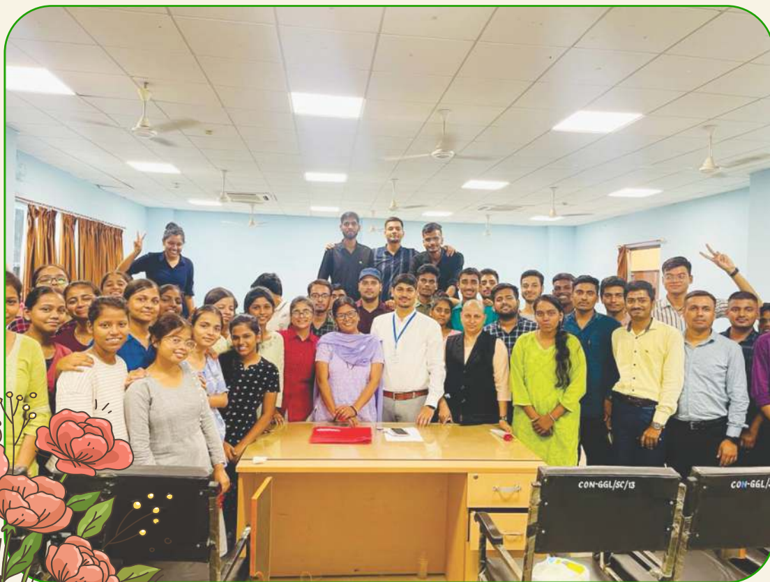
Teachers' day celebration, College of Nursing, SGPGI

In India, the birthday of the second president Sarvepalli Radhakrishnan, 5 th September, is celebrated as Teachers' Day since 1962